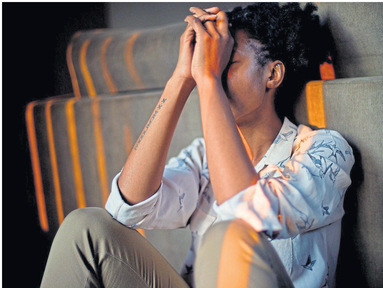
SUFFERING IN SILENCE: If you are having trouble shaking off the negative feelings attached to trauma and struggling to cope, seek out help and support

have done more for others or why you should still be alive when others are not.